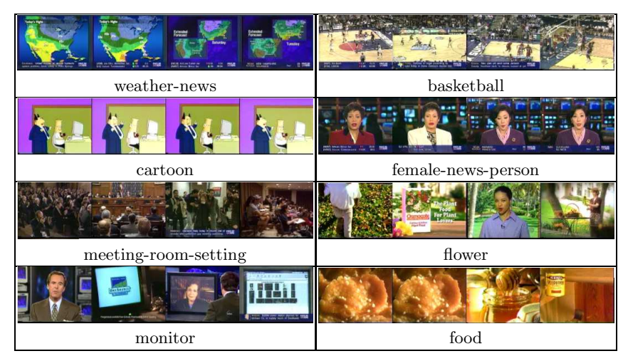
Fig. 4. Ranked query results for some words using manual annotations.