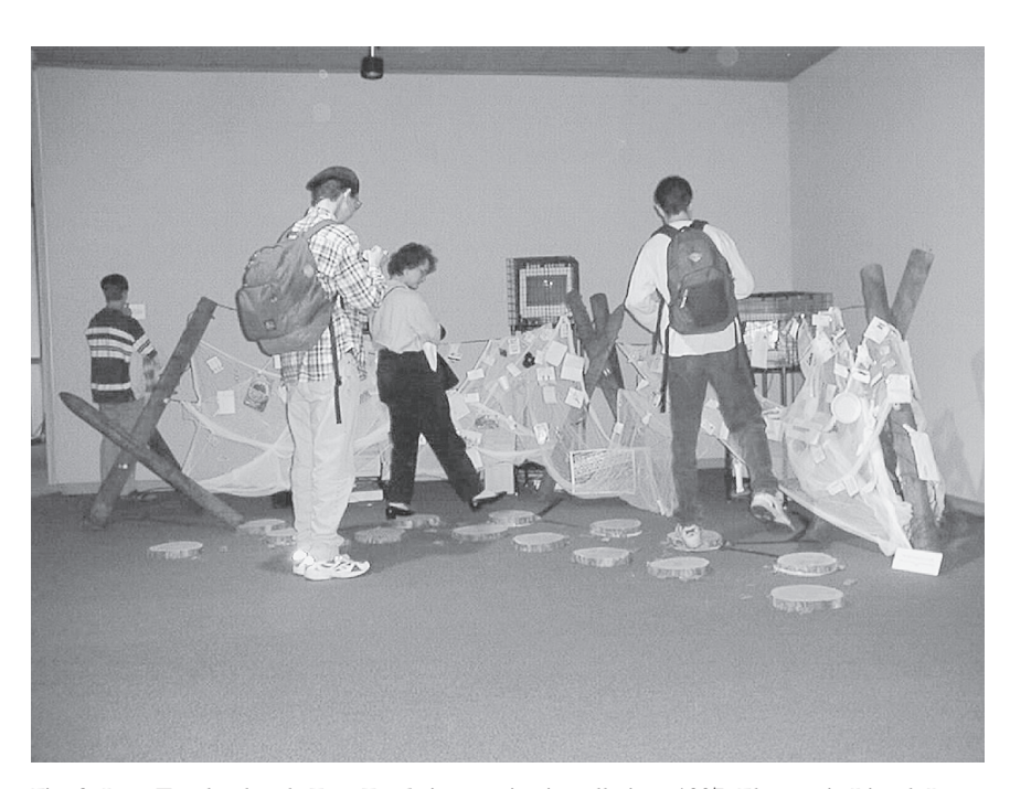
Fig. 3. Joan Truckenbrod, Torn Touch , interactive installation, 1997. Electronic Ritual: Participants engage in a ritual of pinning personal items onto the cloth and activating the virtual world. This ritual creates a connection, a link between the two realms of experience: the cyberworld of virtuality and the physical, embodied world.

In this piece, I intended the cloth to symbolize the connection between virtuality and physicality. Fiber is a connective tissue: a woven network of threads with intersections and nodes. This installation uses cloth to mediate the dichotomy between virtuality and physicality, presence and absence.